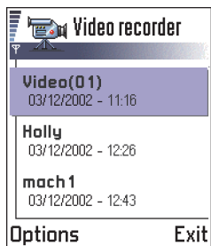
Fig. 2 The main view shows a video clip list