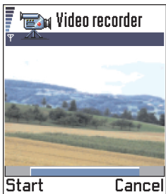
Fig. 1 Recording a video clip

To view what kind of data you have and how much memory the different data groups consume, go to Menu → Tools → Manager and move the joystick to the right to open the Memory view.